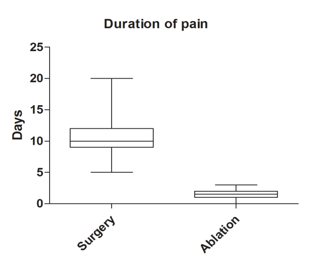
Fig. 3. Box-plot representation of pain duration in the two study groups.

The study's primary outcome measure was to compare the daily self-reported pain score evaluation between the two study groups throughout the follow-up period. Secondary outcome measure was the duration of pain and the com-