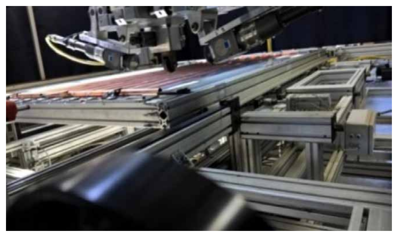
Fig. 2. A double head Nd:YAG industrial laser system. The energy meter is seen in the front-left side of the picture.

also measured since they are directly related to the dilation of the eye's pupil and thus to potential retinal hazard; adequate lighting conditions are reported to be about 500 Lux (normal office) [21].