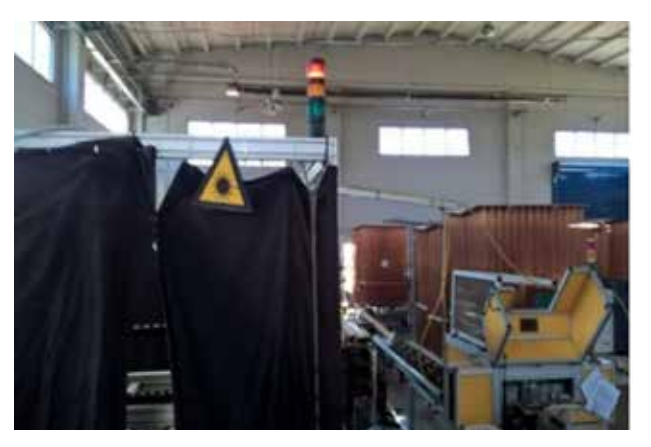
Fig. 4 . The protective curtain of the industrial installation with its opening, through which all measurements were conducted. Signalling and warning light are visible.

The current study was initiated aiming to identify occupational laser exposure, but also to raise the need for OHS. The enormous extent of laser applications, even if the exact