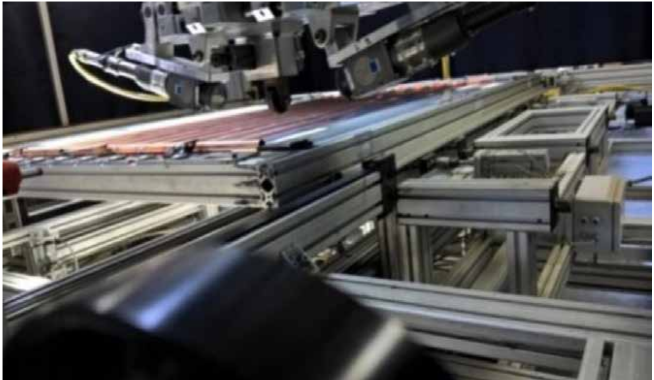
Fig. 2. A double head Nd:YAG industrial laser system. The energy meter is seen in the front-left side of the picture.

also measured since they are directly related to the dilation of the eye's pupil and thus to potential retinal hazard; adequate lighting conditions are reported to be about 500 Lux (normal office) [21].