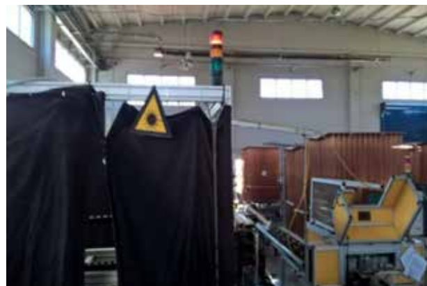
Fig. 4. The protective curtain of the industrial installation with its opening, through which all measurements were conducted. Signalling and warning light are visible.

The current study was initiated aiming to identify occupational laser exposure, but also to raise the need for OHS. The enormous extent of laser applications, even if the exact