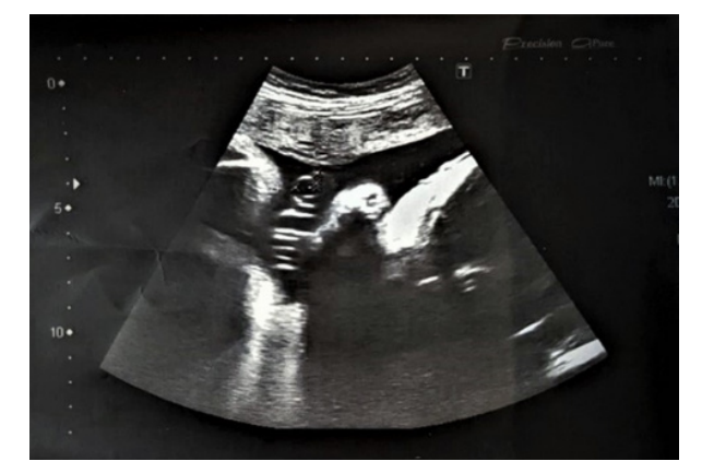
Fig. 3. The diameter of the umbilical vein was measured to be 8.7 mm in a transverse section.

Umbilical artery Doppler indices were recorded in the free loop of the umbilical cord. Pearson correlation coefficient test was performed to check the correlation of umbilical coiling index with Doppler indices of umbilical arteries. The mean peak systolic velocity was found to be 47.5 \pm 3.7 cm/s (Fig. 2). There was a non-significant correlation between the coiling index and PSV of the umbilical artery (P=0.169). According to the Pearson correlation test, the correlation was weak and positive (r=0.202). The mean resistive index was found to be 0.59 \pm 0.04 . There was a non-significant correlation between the coiling index and RI of the umbilical artery (P=0.905). According to the Pearson correlation test, the correlation was very weak and positive (r=0.018) (Table 2).