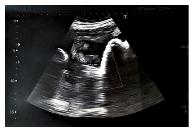
Fig. 1. Ultrasound image of a normocoiled umbilical cord with an antenatal umbilical coiling index (UCI) of 0.43 and intercoil distance of 2.3 cm along the cord axis.